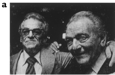
Figure 2 The Deathblow to a long-term partnership. (a) Alan Jay Lerner, left, and Frederick Loewe, right, the legendary partnership of 17 years that produced My Fair Lady and many other hit musicals on Broadway. (b) Obituary of Alan Lerner published on the front page of The New York Times on June 15, 1986. (c) Obituary of Frederick Loewe published on the front page of The New York Times on February 15, 1988.